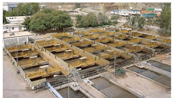
Darsait WTP - Oman