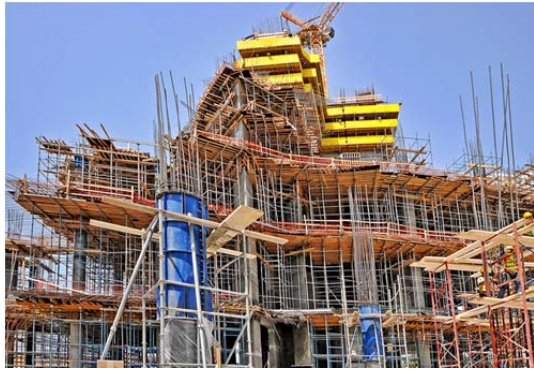
Jeddah Pumping Station - Saudi Arabia