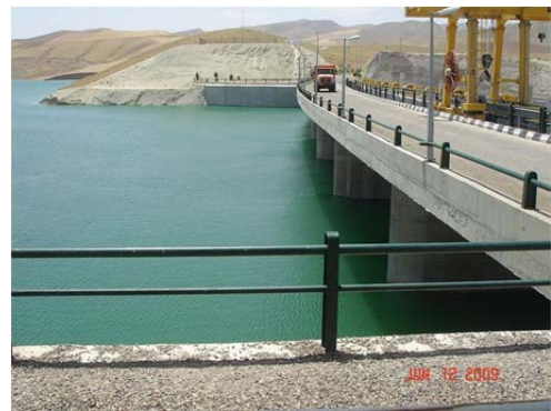
Doosti Dam - Iran