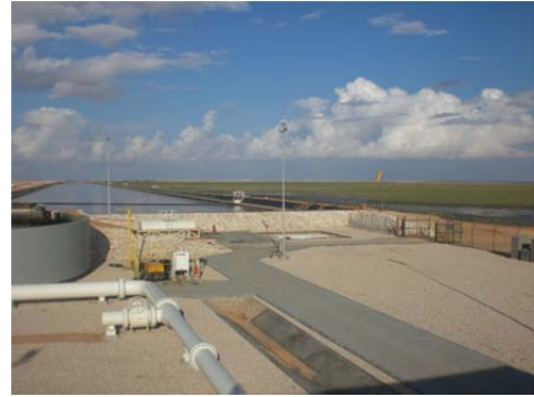
Nimr WTP - Oman