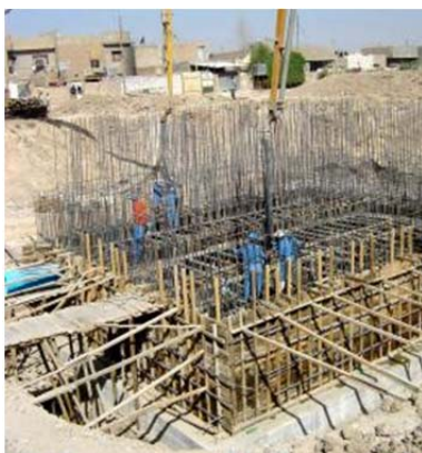
Al Kamaliya WTP - Irak