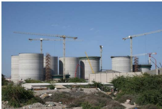
Fujairah Grain Silos - U.A.E